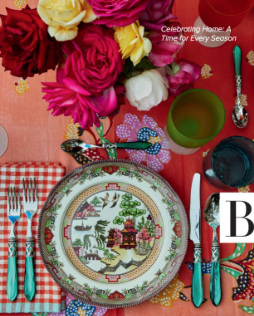
Celebrating Home: A Time for Every Season